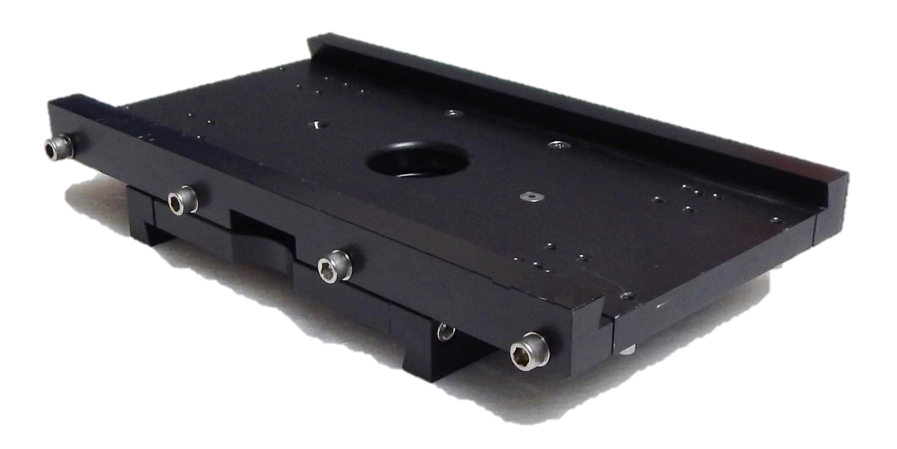
600358 - Planewave Fixed Dovetail Plate allows you to mount the existing dovetail clamp (200919), which come standard with the A200 mount, onto the tandem bar