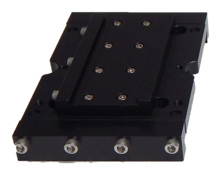
600357 - D-Style Fixed Dovetail Plate mounts directly to the tandem bar and allows you to attach any telescope with a Losmandy D- style dovetail mounting bar.